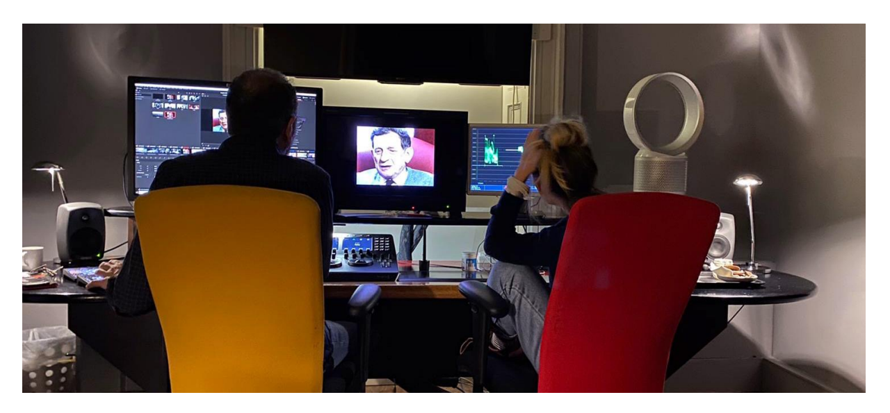
Colour grading Infinite Potential at High Wire in Dublin.

For me the finished project is truly amazing. It raises many very important questions that are so relevant for the uncertain times we live in. It also provides direction on how we might begin to answer those questions.