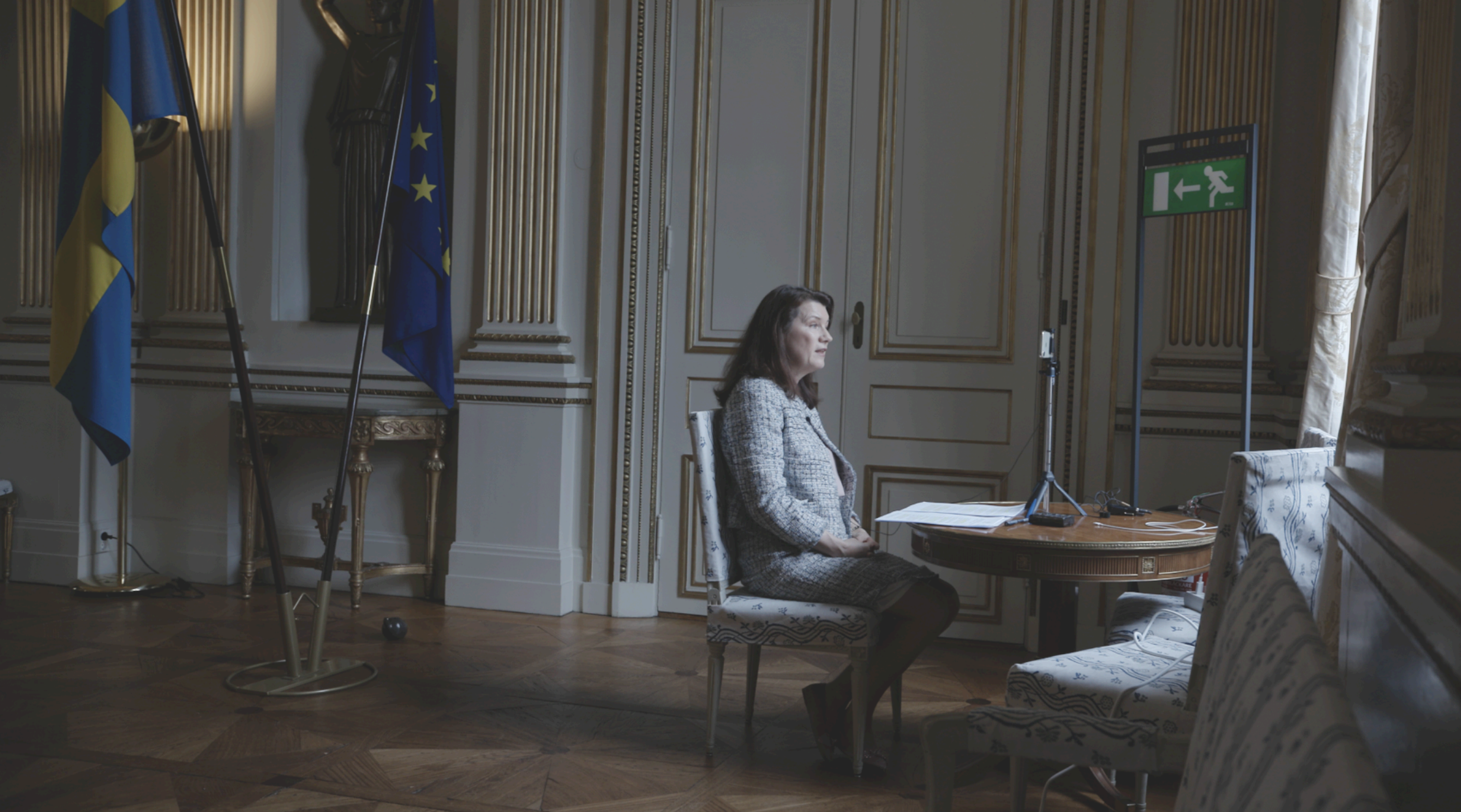
The Foreign Minister Ann Linde explaining the allegedly unique Swedish Model live on France 24