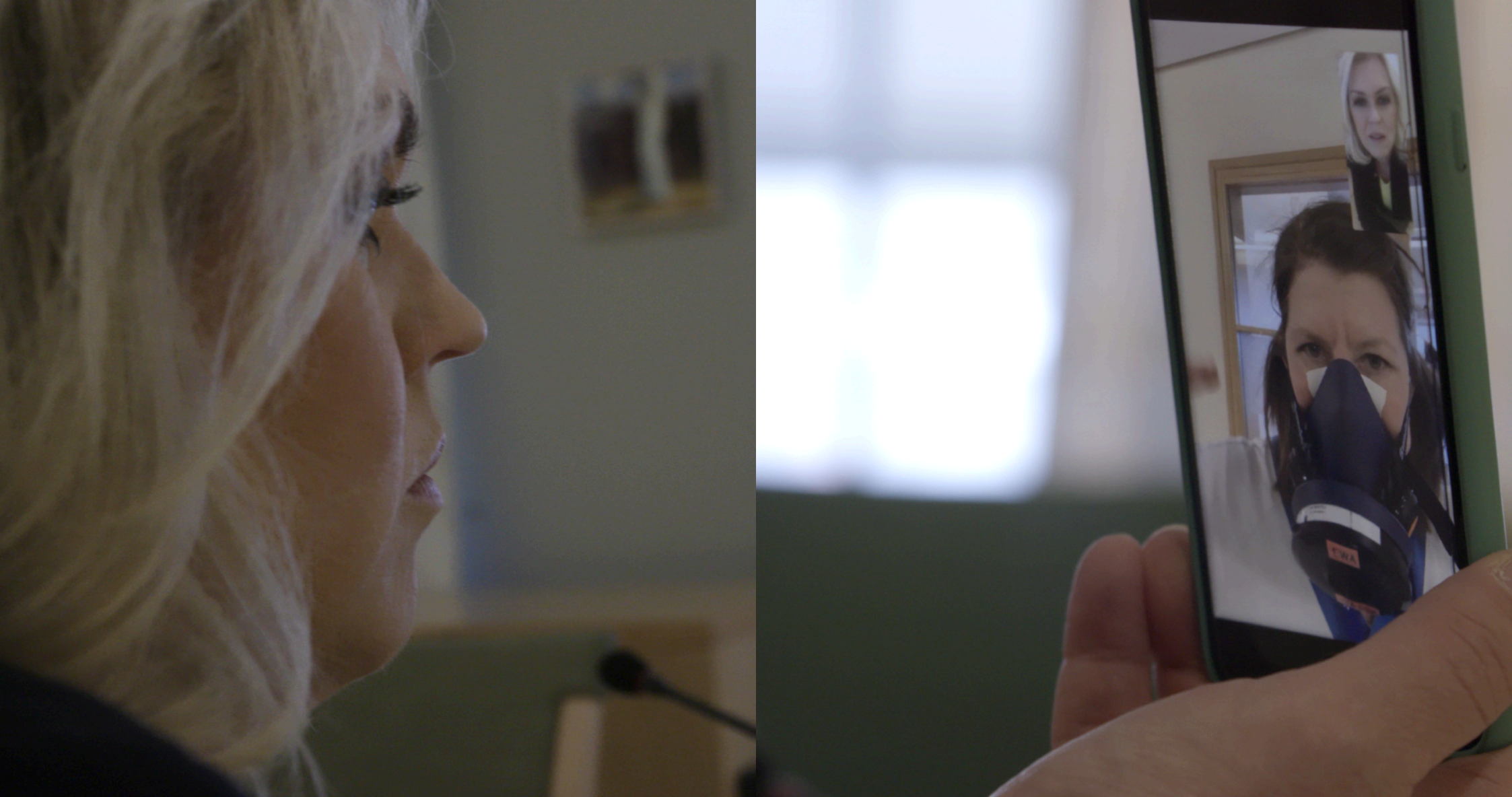
The Health Minister Lena Hallengren meeting the health workers - online.