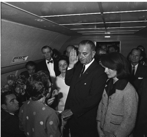
Lyndon B Johnson