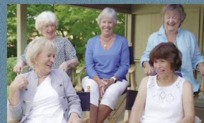
FROM TENNIS TO STOCKS INVESTMENT CLUB