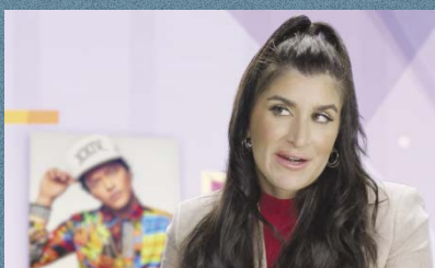
HALEY SACKS Personal Finance Influencer Instagram @mrsdowjones