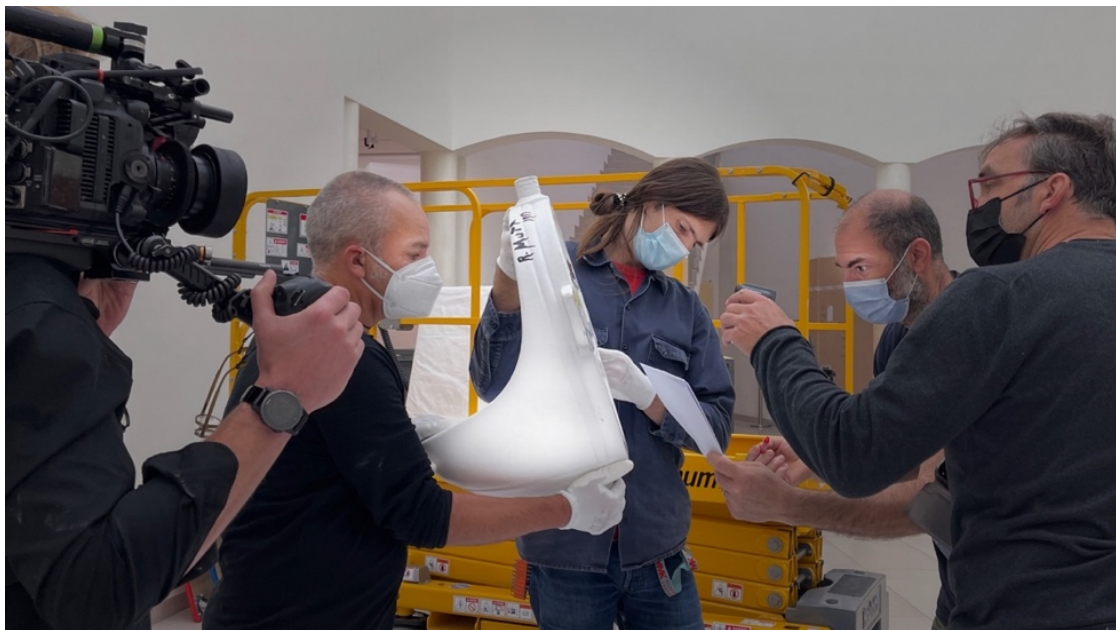
Setphoto, Marcel Duchamp exhibition at MMK Frankfurt, 2022